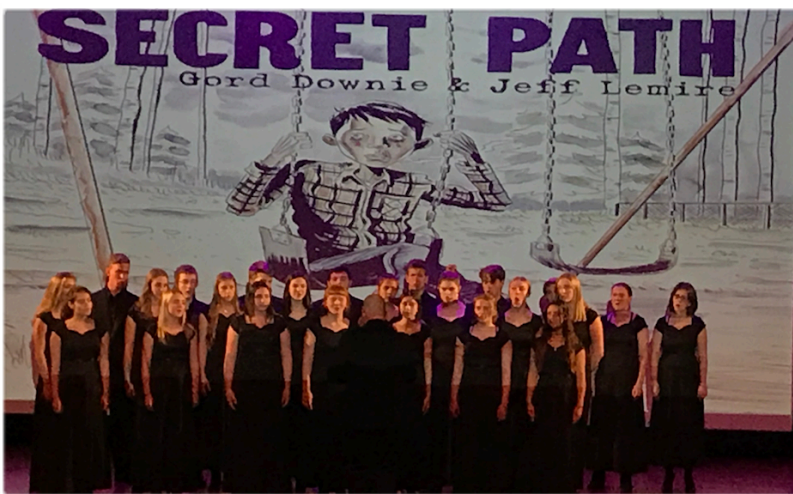
Windsor Secondary Choir