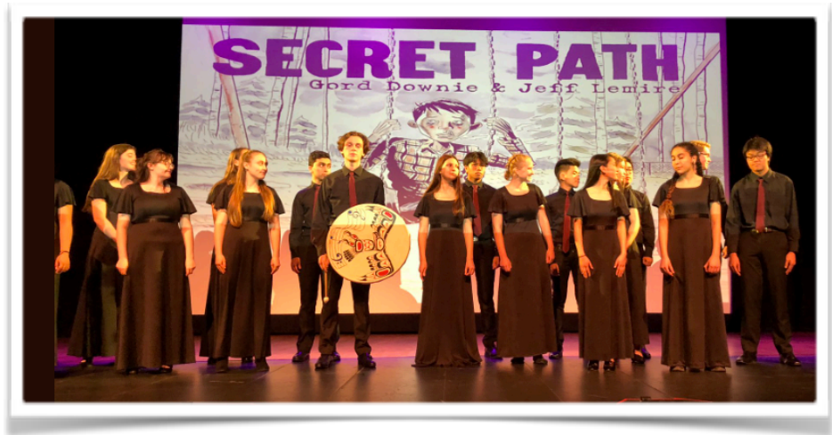
Carson Graham Secondary Choir